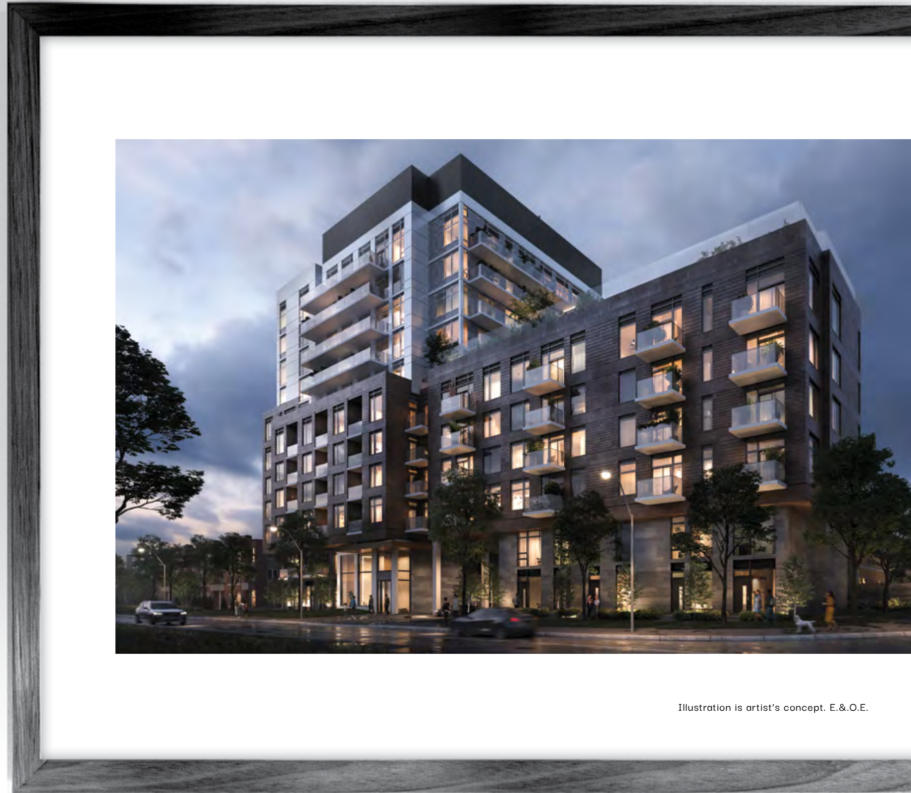
Illustration is artist's concept. E.&O.E.